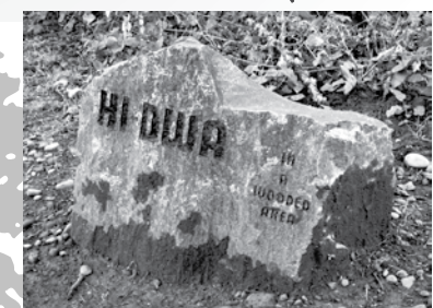
Hi-Dwa = in a wooded area