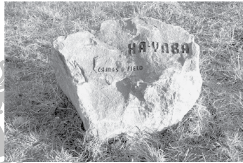
Ha-Yaba = camas field