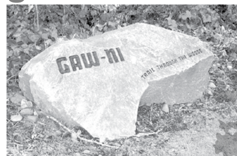
9 Gaw-Ni = trail through the woods