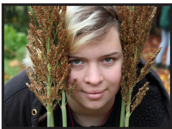
Students love the Edible Schoolyard.

During this season of giving, you can help Nearby Nature continue to provide NCS teens, as well as so many others, with opportunities to discover, learn, and grow in nature. Check out the coupon below and see nearbynature.org/contribute for the many ways you can support our work in 2024.