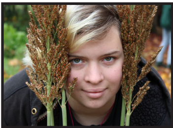
Students love the Edible Schoolyard.

During this season of giving, you can help Nearby Nature continue to provide NCS teens, as well as so many others, with opportunities to discover, learn, and grow in nature. Check out the coupon below and see nearbynature.org/contribute for the many ways you can support our work in 2024.